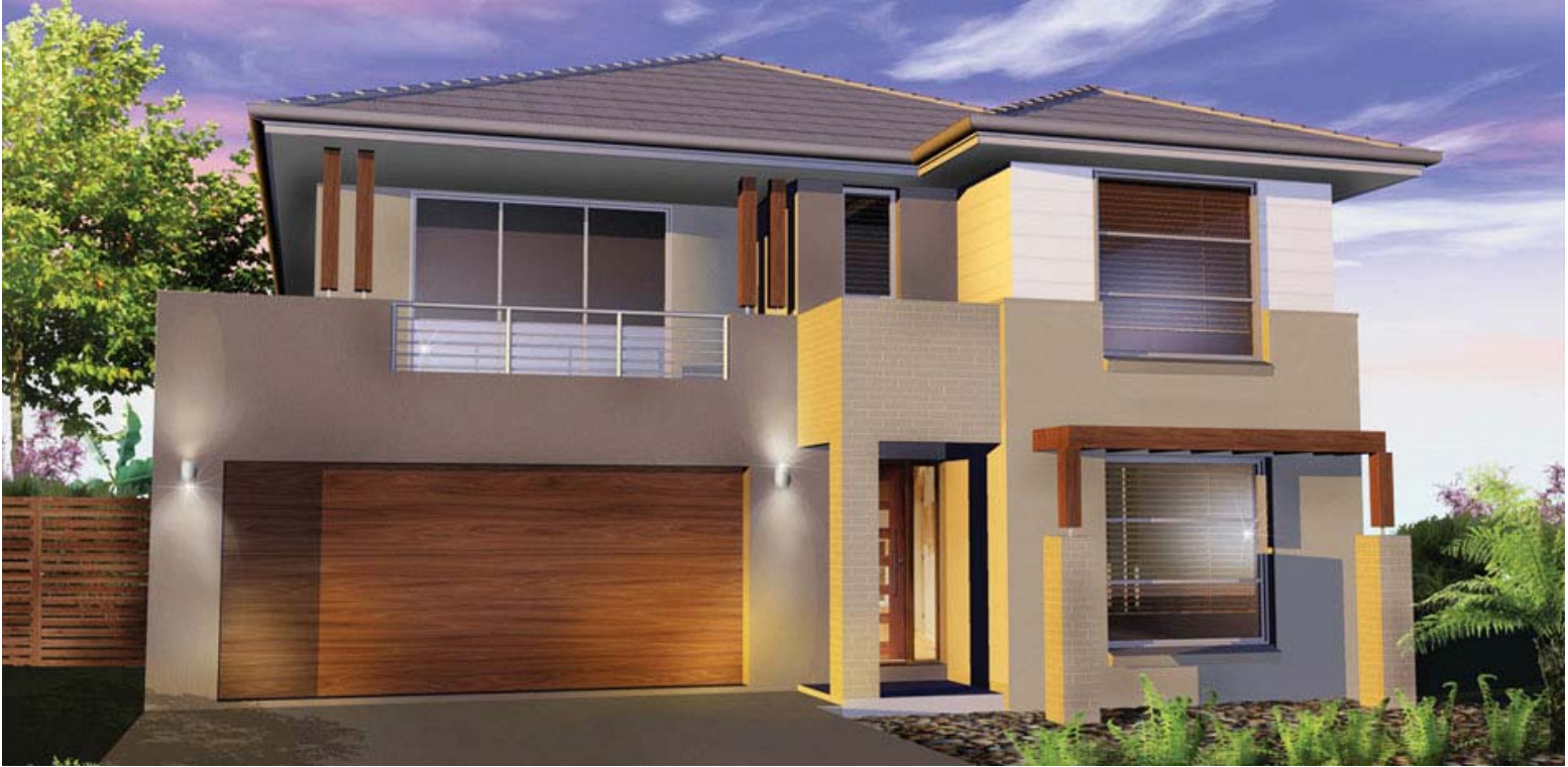
*For illustration purpose only