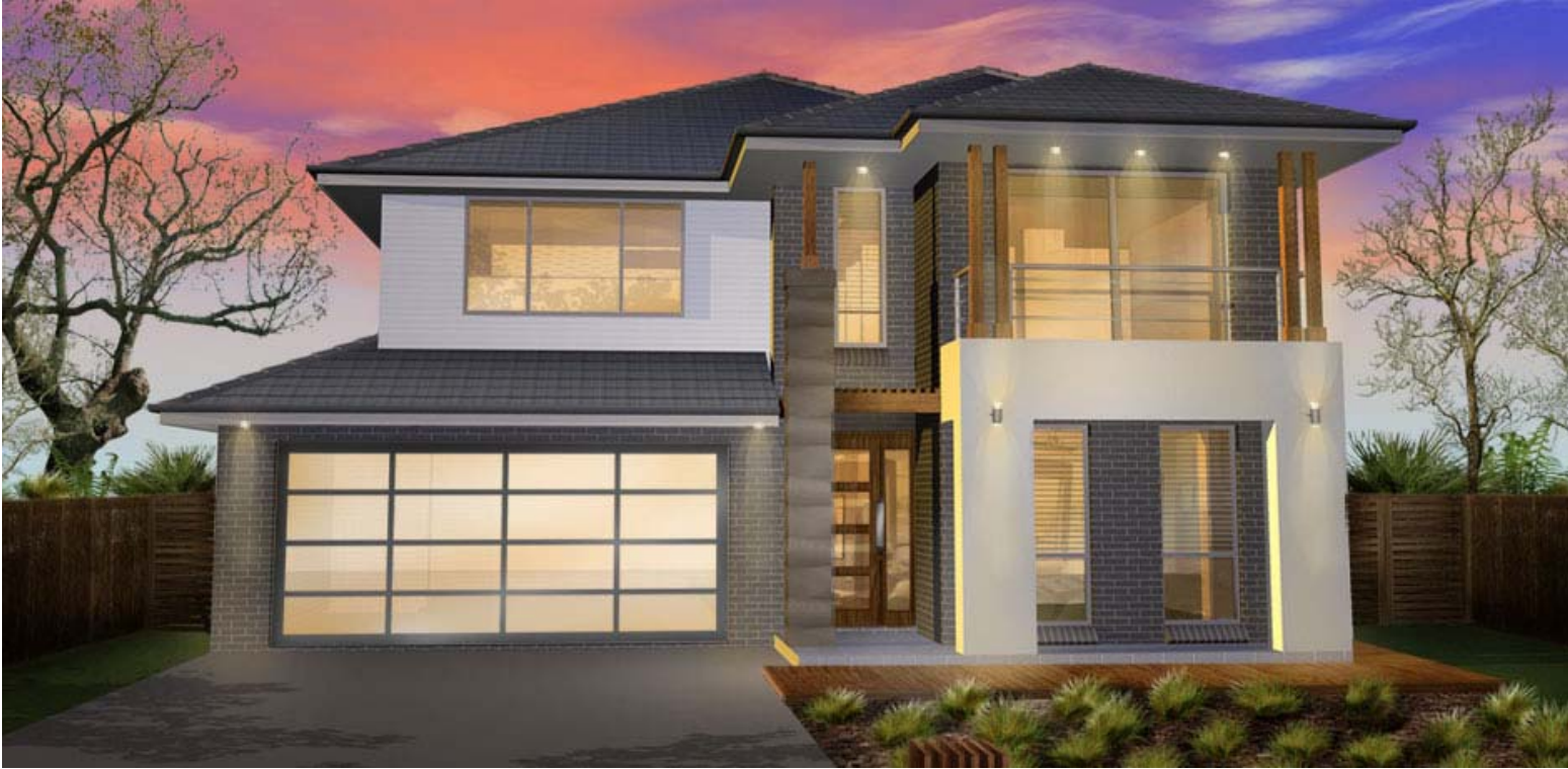
*For illustration purpose only